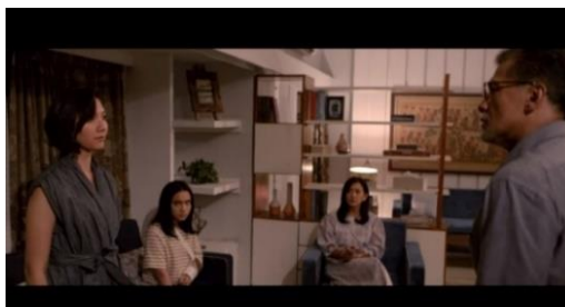
Figure 8. Aurora explains about her feelings

Aurora's actions are shown through a penetrating look at her father and immediately stand as a sign that Aurora is really serious about saying that her family has lost her long ago. After Aurora's explanation to her family, Aurora seems to want to leave her family without speaking at all, but Awan holds her back because Awan wants to apologize for her mistake at the Art Exhibition Building.