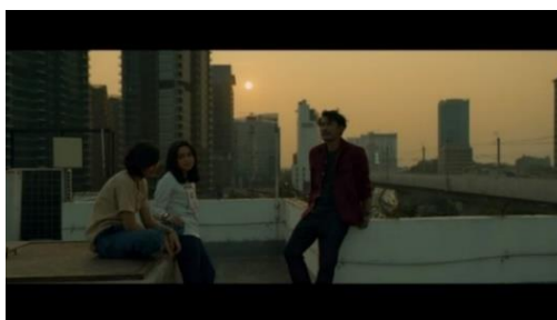
Figure 10. Aurora's telling about herself to Angkasa and Awan

Aurora told her feelings by enjoying the view of the sunset and gusts of wind are quite strong. The expression shown by Aurora was also a little happy because she was finally able to gather with her two siblings to tell them about herself and also their father Aurora looked quite simple by using a beige woman's blouse, light blue jeans and still using a bracelet on her left hand, the makeup used also tends to be natural and a neat hairdo. This shows that Aurora does not really like the appearance that is too striking when it is at home or outside the home.