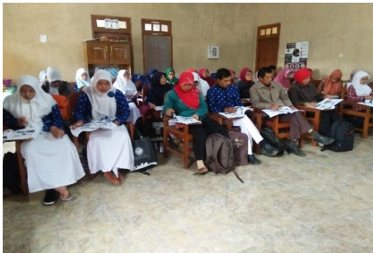
Figure 1. Theory Session at the time of training

From the results of the above chart there is an increase in the ability of teachers in the understanding of learning media. The results obtained in each individual increased and they began to understand about the making of media in accordance with aspects of child development. Here are the photos created by teachers of Selo sub-district, made with basic materials of bamboo and modified with other natural media such as leaves, lidi, taro rod and others to introduce local wisdom of Selo district.