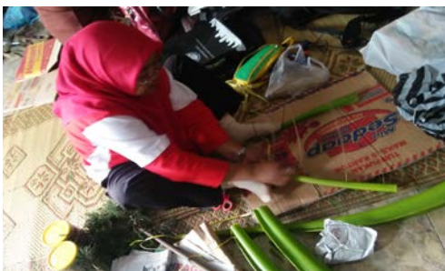
Figure 3. Working group make media