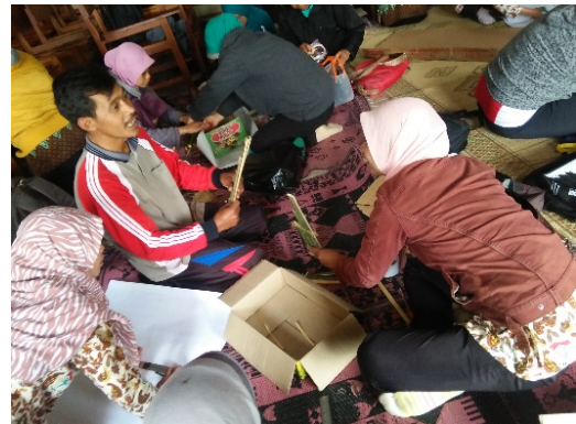
Figure 2. Discussion Session to make media from Bamboo