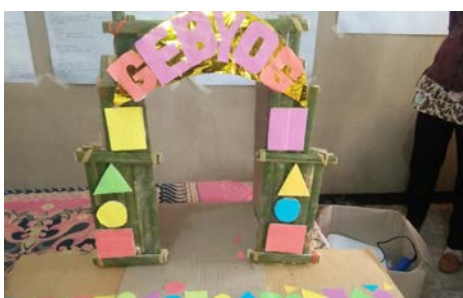
Figure 5. Exemple media from bamboo, make gebyog from bamboo for learn mathematic