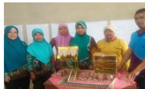
Figure 4. Presentation of the result made