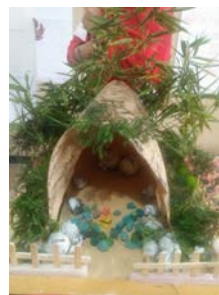
Figure 6. Example media from bamboo, make Raja Cave for learn