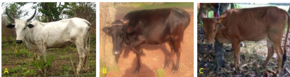
Figure 1. Phenotypic characteristics of White Fulani (A), Muturu (B) and Pasundan (C) cows

after which they are allowed to go for grazing till evening during the raining season while chopped forages are provided for them in dry season. They were provided with shed. No specific breeding program was adopted (allowed to mate randomly) by the cattle owners. In order to prevent inbred population during the sampling, matured individuals (2-3 cattle per farmer) were sampled from different farmers apart. Pasundan cows were managed intensively in the colony stall. Amount 2 kg/head of commercial concentrate and 25 kg/head of Elephant grass ( Pennisetum purpureum ) were given in the animal. The artificial insemination (AI) method was managed in each cow with Pasundan frozen sperm. Hence, the inbred population during sampling can be prevented according to the pedigree records in each animal.