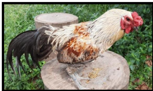
Figure 1. Kampung Chickens