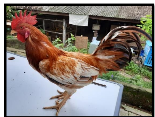
Figure 3. Merawang Chickens

chicken, but Kampung chicken and Sentul chicken are significantly different ( P < 0.05 ) with Merawang chicken. The average body weight of 2 months, 3 months and 4 months showed that the Kampung chicken was significantly different ( P < 0.05 ) than Sentul chicken and Merawang chicken, while Sentul chicken was significantly different ( P < 0.05 ) compared to Merawang chicken. This shows that Kampung chicken has the heaviest compared to Sentul chicken and Merawang chicken.