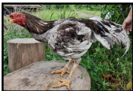
Figure 2. Sentul Chickens