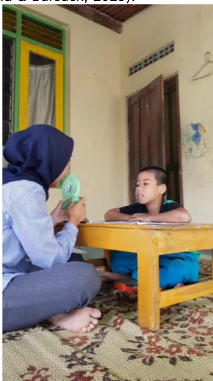
Figure 11. Use of concrete objects (fans) as a learning medium for children with hearing impairing

Children with special needs with hearing impairments are accompanied by paraprofessional during learning to verbally review the material, as noted by Kafle et al., (2019). Material is presented in written form and includes more illustrations and explanations. Field findings also indicate that teachers use three-dimensional media, namely models of windmills and fans (Zakia, Sunardi & Yamtinah, 2016). During teaching, paraprofessional is directly in front of the students, allowing them to clearly see the teacher's lips (Friend & Bursuck; 2019).