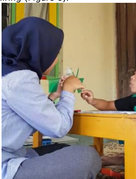
Figure 5. A child with hearing impairment learns using a windmill model.

In addition to green open spaces and plants, Giwangan Elementary School also uses artificial media, such as big books and windmill models. Big books have been shown to increase learning interest in slow-learning students (Nugroho & Prasetyo, 2019). Sedangkan model koncir angin digunakan untuk mengajarkan perubahan energi untuk anak dengan hearing empairing (Figure 5).