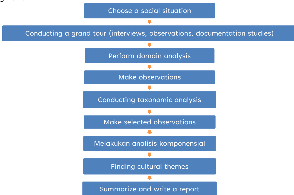
Figure 1. Research procedure (Spradley, 1980)

The research method used is a case study with research procedures as shown in the Figure 1.