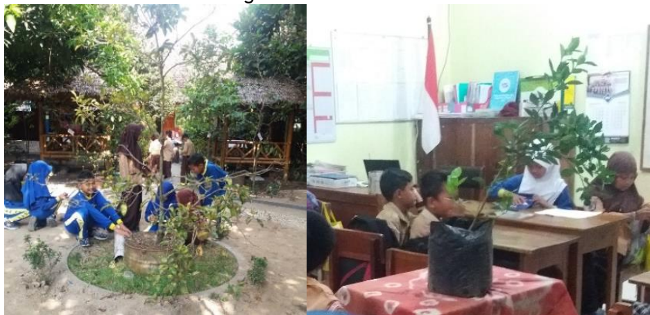
Figure 3. Green open spaces and plants as natural learning media

learning media. This is supported by Kumari & Kataria (2022), who argue that students with special needs should be brought into natural environments.