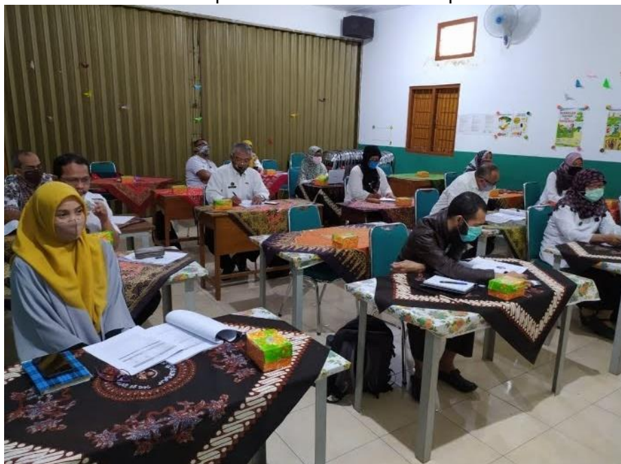
Figure 2. Participants in the curriculum development workshop consisted of school principals, teachers, paraprofessionals, parents, school supervisors, and experts from educational staff training institutions.

This finding supports the conclusion of Mirna & Chamidah (2025), who stated the importance of collaboration between teachers and parents in inclusive education in schools. The paraprofessional's role is to discuss with class teachers, modify teaching materials, and record the development of children with special needs.