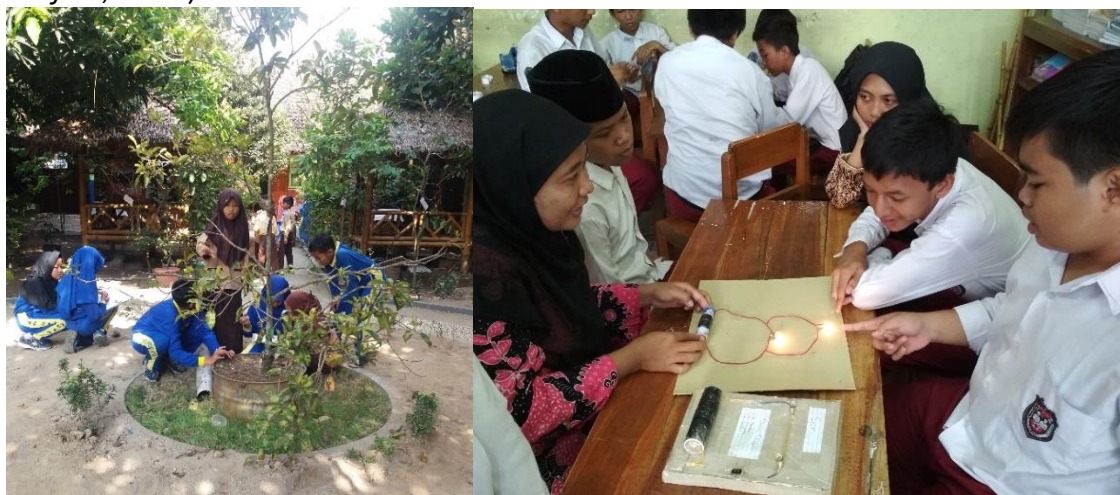
Figure 12. Students performing science process skills

These activities show students observing, communicating, inferring, and predicting (NGSS, 2013). This process improves the quality of learning as stated by (Hadis & Nurhayati, 2018).