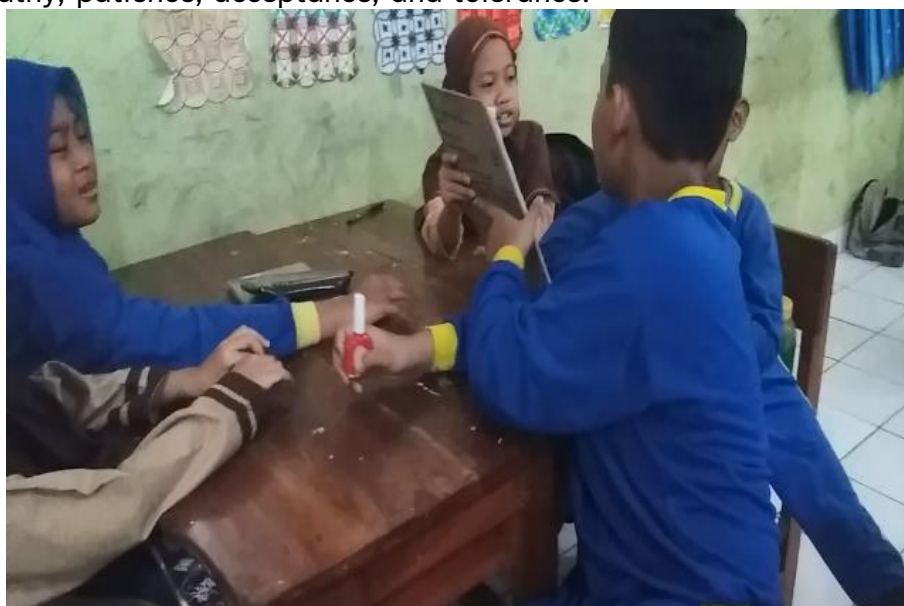
Figure 13. A slow learner child who receives support from peers in group work.

Based on observations, classroom management at Giwangan Elementary School is integrated, with children with special needs and those without special needs being placed in the same class. This fact aligns with the idea of Friend & Bursuck (2019) that inclusive schools must fulfill three types of integration: physical integration, social integration, and teaching integration. This concept of integration is supported by the idea Aisy & Aprilia (2025) which suggests that interactions in inclusive classes can hone empathy, patience, acceptance, and tolerance.