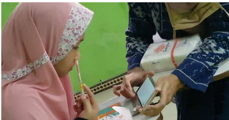
Figure 10. Smartphone use for slow learner children

Children with visual impairments are placed at the front, close to the light, and learn using concrete objects or modified media, such as embossed maps. Children with