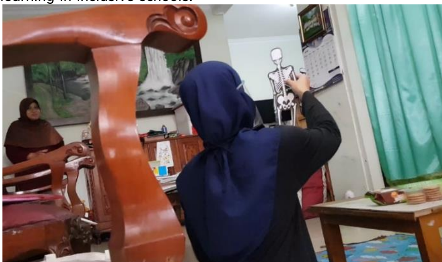
Figure 9. Parents always prepare the learning process for their children with special needs.

Interview results indicate that parents play a significant and crucial role. Parents must be willing to cooperate and maintain good communication with the class teacher and paraprofessionals (Paseka & Schwab, 2020). An example of cooperation between parents and schools is helping children prepare tools and materials for science experiments and communicating with teachers, as found by Adam (2013). Observation results also showed good cooperation between parents and paraprofessionals so that students with special needs received good learning services. This confirms the findings of Bariroh (2018) which states that the role of parents has a great influence on the quality of learning in inclusive schools.