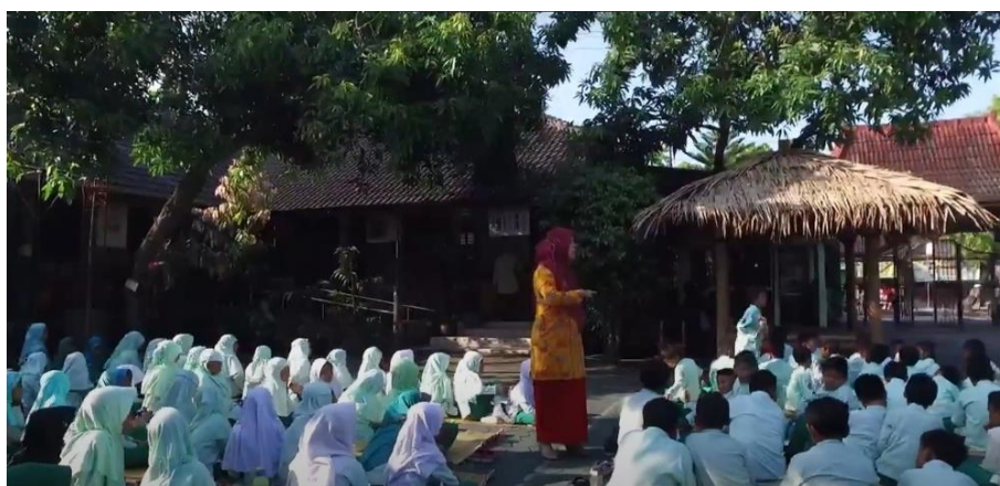
Figure 7. The principal provides reinforcement and motivation to students and teachers regarding the attitude of living together in differences.

The principal, based on findings at Giwangan Elementary School, consistently acts as a discussion partner for teachers, for example, providing guidance when teachers develop lesson plans (Figure 6). Furthermore, as mentioned in the previous section, Giwangan Elementary School has experienced significant policy changes, making the school's role as a transformational leader highly strategic. The principal demonstrates this role by assertively educating school elements targeted by the policy changes. For example, the principal regularly delivers messages at each morning assembly about the importance of embracing diversity. These messages of inclusivity are repeated not only to maintain awareness but also because new students arrive each year. This education is necessary as a follow-up to the policy of integrating regular and special needs students. This role is strengthened by Syuhada et al., (2025) who stated that a