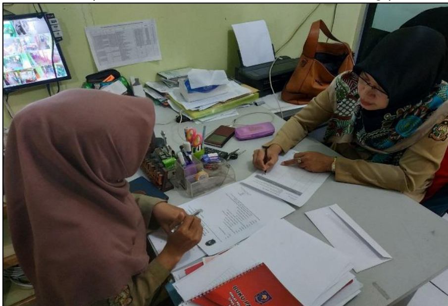
Figure 6. The principal guides class teachers in preparing lesson plans