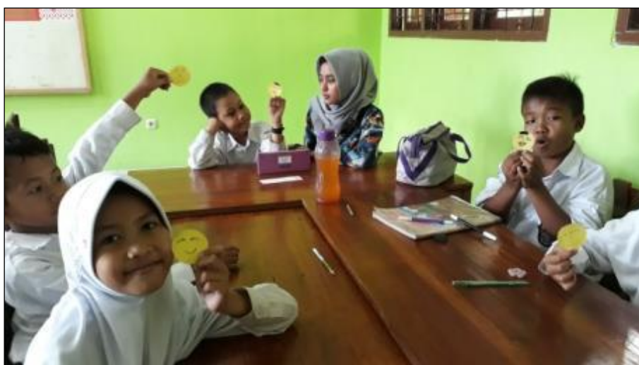
Figure 8. A paraprofessional accompanies a student with special needs.