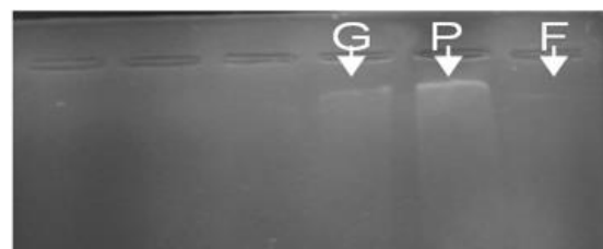
Note: G: Salak Gading; P: Salak Pondoh; F: Crossing of Salak Pondoh and Gading

DNA concentration is used as a reference to improve the success of DNA amplification. DNA concentration was calculated by A260 times 50 times dilution factor. The higher the concentration of DNA, the easier it is for researchers because it can be diluted as needed and as a DNA stock