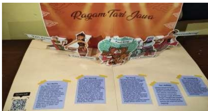
Figure 3. Traditional Javanese Dance Page on Pop-up Book

Traditional Javanese dance in the Pop-up Book is presented in the form of growing pictures and videos. Growing pictures are designed to increase children's motivation and curiosity. The video is designed to show the complete dance movement so that it makes it easier for children to follow the movements. Dance learning is learning that invites children to play while learning so that it can help develop children's motor skills, introduce culture, and foster an aesthetic sense, critical attitude, and appreciation (Sandi, 2018).