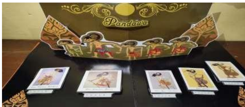
Figure 4. Wayang Pandawa Page on Baneswa Pop-up Book

The Baneswa Pop-up Book contains batik patterns and batik painting skills. Batik is one of the cultures found in various regions in Indonesia and must be preserved. The island of Java has a distinctive and diverse batik motif. According to (Prasetyo, 2016) batik motifs are patterns or picture frames found on batik cloth so that they become the whole batik. Batik pattern is a picture frame on batik in the form of a combination of lines, shapes and isen into a single unit that embodies batik as a whole. According to (Suliyati & Yuliaty, 2019)) batik patterns created in the past can also show the social status or identity of the community, the level of rank and nobility of the wearer. According to (Suliyanto et al., 2015) patterns can be created freely because one type of batik is written as batik so it is free to draw batik patterns. The Pop-Up Book also includes the skills to paint batik patterns. The steps for making batik are also presented through videos that children can follow with teacher supervision.