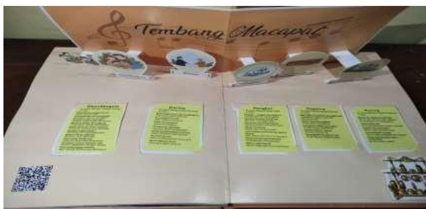
Figure 2. Traditional Songs Page on Pop-up Book