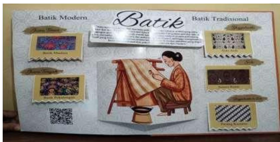
Figure 5. Pop-up book showing variety of batik patterns and painting skills

The Baneswa Pop-up Book contains batik patterns and batik painting skills. Batik is one of the cultures found in various regions in Indonesia and must be preserved. The island of Java has a distinctive and diverse batik motif. According to (Prasetyo, 2016) batik motifs are patterns or picture frames found on batik cloth so that they become the whole batik. Batik pattern is a picture frame on batik in the form of a combination of lines, shapes and isen into a single unit that embodies batik as a whole. According to (Suliyati & Yuliaty, 2019)) batik patterns created in the past can also show the social status or identity of the community, the level of rank and nobility of the wearer. According to (Suliyanto et al., 2015) patterns can be created freely because one type of batik is written as batik so it is free to draw batik patterns. The Pop-Up Book also includes the skills to paint batik patterns. The steps for making batik are also presented through videos that children can follow with teacher supervision.