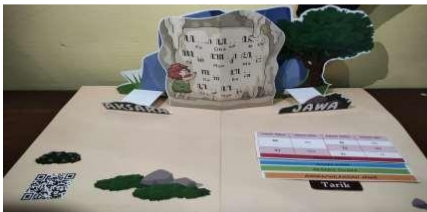
Figure 6. Javanese Script Pages in Pop-up Book

Batik patterns can be used as a medium for character education in elementary schools. Each style of batik has a special philosophy and meaning that contains a message of wisdom for human life. Batik activities can teach children about patience and creativity to produce the beauty of batik patterns. Batik skills in children can provide a special experience and develop their motor skills. Other content in Baneswa's Pop Up Book is Javanese script. Here is one of the Java script content pages.