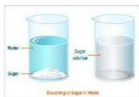
Figure 3.6 melarut