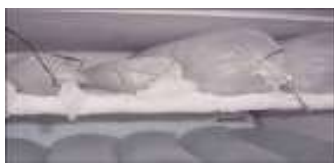
Figure 3.3 membeku