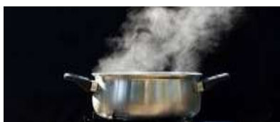
Figure 3.1 Menguap