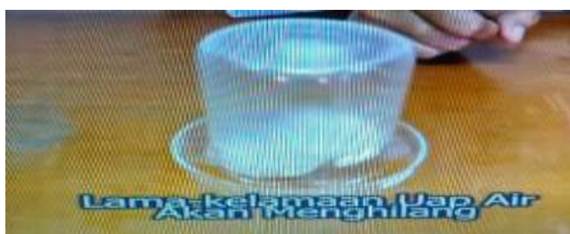
Figure 3.13 http://www.youtube.com/watch?v=xPDIR-HyEic

Physical properties include form, color, odor, hardness, boiling point and melting point, particle size carrying capacity, and density. Ice that melts both in the form of ice and in the form of liquid both remain water, namely H_2O . Chemical reactions are unique, in some specific chemical reactions can form a gas. An example of a