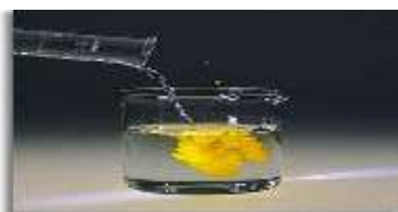
Figure 3.8 Terbentuk endapan