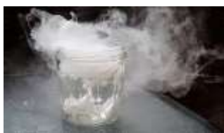
Figure 3.5 Menyublim