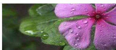
Figure 3.2 mengembun