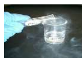
Figure 3.10 perubahan suhu