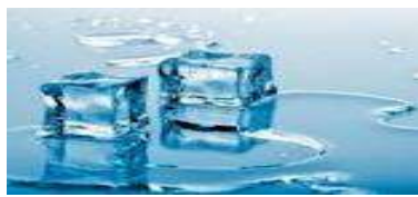
Figure 3.4 mencair