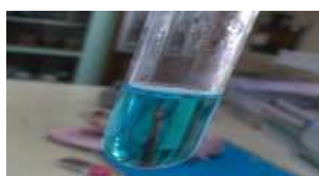
Figure 3.9 perubahan warna