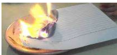
Figure 3.11 Terbentuk zat baru