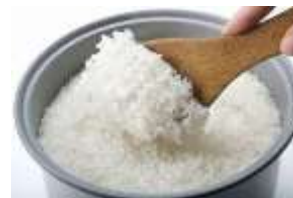
Figure 3.7 perubahan bentuk