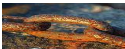
Figure 3.12 perubahan unsur zat penyusun