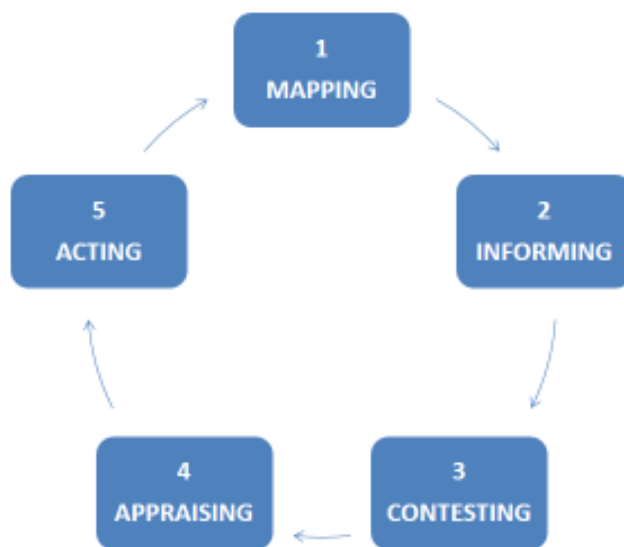
Figure 4. The reflective model by Bartlett (1990)

The next model of reflection is proposed by Bartlett (1990). This is a cyclical model with five major stages: mapping, informing, contesting, appraising and acting. The flow of the model can be analysed in Figure 4.