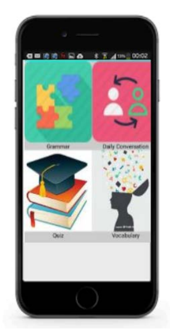
Figure 2. Main Menu Display of the English for Disability application

The design stage was conducted by making the navigation map and storyboard. The purpose of the navigation map is to provide an explanation on each section or sub-section of the navigation or button on the application. The goal of the storyboard is to provide an explanation of the narrative path in the application.