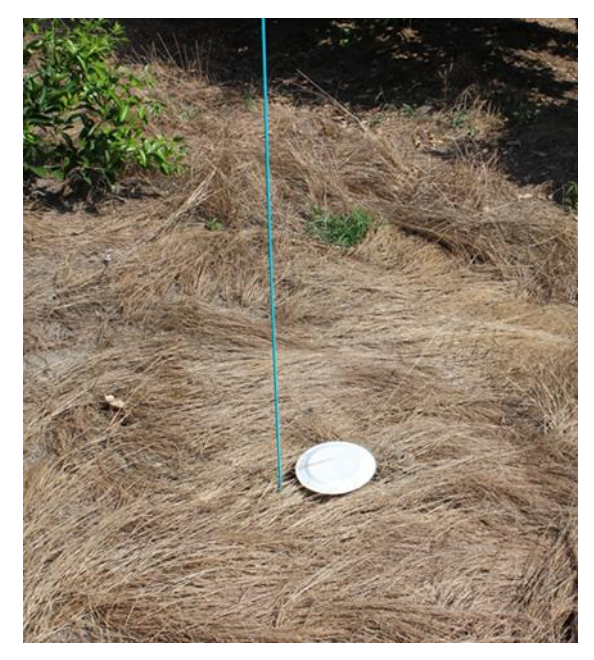
Figure 1. Illustration showing the installation of pitfall traps

A plastic cup with a diameter and height of 90 mm and 120 mm was embedded in the ground and filled with 100 ml of 70% ethanol to exterminate and preserve the captured insects. Figure 1 illustrates the installation of an 18 cm diameter paper plate over the trap, as a rain shield. Subsequently, five traps were set in each plot and recovered after a week to identify the species of the captured ground-dwelling arthropods and estimate their populations. These devices were set up seven times on April 28, May 23, June 28, July 21, August 21, September 29 and October 30, 2017.