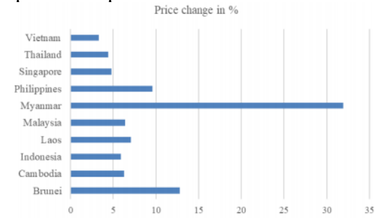
Table 1. Impacts of Covid-19 on food security and poverty (Cole, 2020).

APTERR member countries also realise their similarity in needs, good qualities, and trust between each member country. considering geographically their regions have a massive potency on becoming fertile lands. The pretty big similarity between countries on the needs of rice also means a pretty big similarity in their food problems. With the formation of APTERR, instead of creating market, member countries are signaling mutual interest to prevent rice shortages in each country and minimize price spikes in the future.