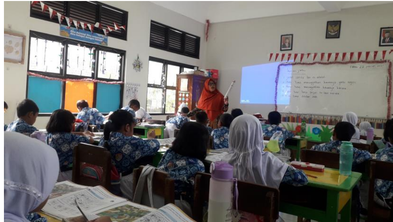
Figure 1. Intracurricular Learning on Merdeka Curriculum