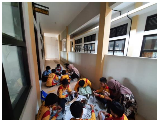
Figure 2. Co-curricular Learning: Making Batik

This curriculum not only teaches academic aspects, but also emphasizes the development of students' critical skills, creativity, and independence (Qurota et al., 2024). With a student-centered learning approach, students are empowered to take an active role in the learning process, choose learning methods, and develop personal projects according to their interests (Rambung et al., 2023). In addition, holistic assessment allows evaluation of student progress from various aspects. The curriculum also instills civic values, producing students who are responsible and care for the environment (Alanur et al., 2023). This positive impact can also extend to learning motivation, student satisfaction, and parental involvement in supporting their children's education at the primary school level (Tabroni et al., 2022). Continuous evaluation and monitoring are essential to ensure successful implementation of this curriculum.