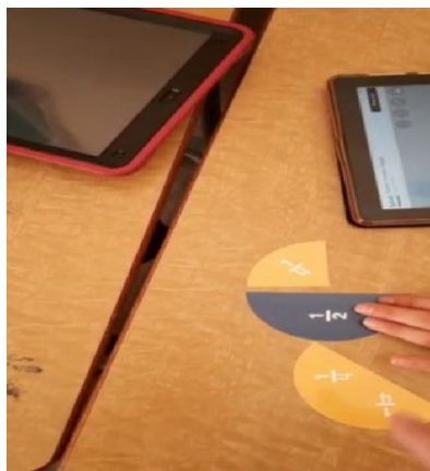
Figure 2. Using Concrete Manipulatives in Teaching Fractions (Kamal et al., 2024).

The results show that using tangible manipulatives greatly improved students' conceptual grasp of fractions, especially when it came to comparing fractions, comprehending equivalent fractions, and carrying out fraction addition and subtraction in a more substantial manner. According to this viewpoint, fraction blocks serve as a link between students' practical experiences and formal mathematical ideas, which are necessary for studying mathematics in elementary school.