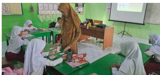
Figure 3. The teacher provides reinforcement and feedback