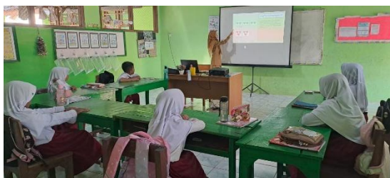
Figure 2. The learning process using flashcard media

Student interview findings also supported these results. Several students reported that flashcards made learning easier because the problems were clear and allowed immediate responses. Students described using step-by-step strategies, such as repeated addition for multiplication and equal sharing for division. This is reflected in students' statements: "If I see 3 \times 4 , I count 4 + 4 + 4 so I understand," and "For division, I try to share equally first, then I count." Another student stated, "If the card appears again, I remember my mistake and fix it," indicating that repetition supports both memory and understanding. Students who initially felt unsure reported increased confidence when the teacher provided simple guidance and allowed them to retry the task.