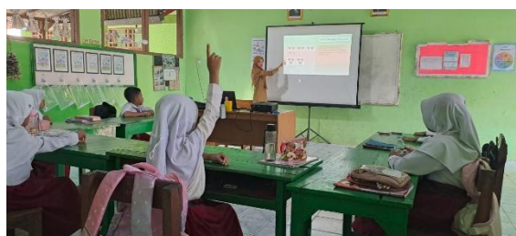
Figure 4. Question and answer discussion activity

The classroom images (Figures 2–4) further support these findings. The images show that students were actively engaged, raising their hands and focusing