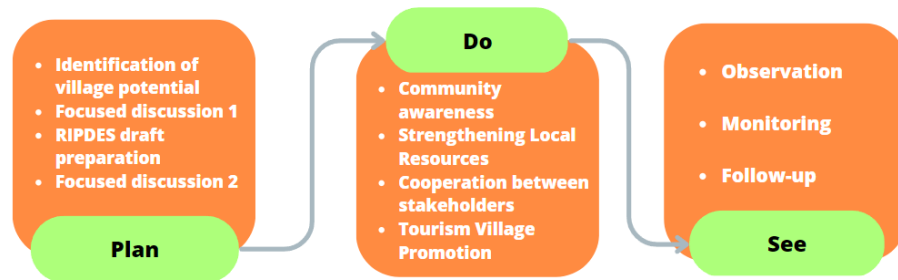
Figure 2. The Development Model of Community-Based Tourism Village in Nagari Koto Sani

Based on this model, there are three main stages in developing a community-based tourism village i.e., 1) planning, 2) implementation and 3) reflection. Here's a further explanation: