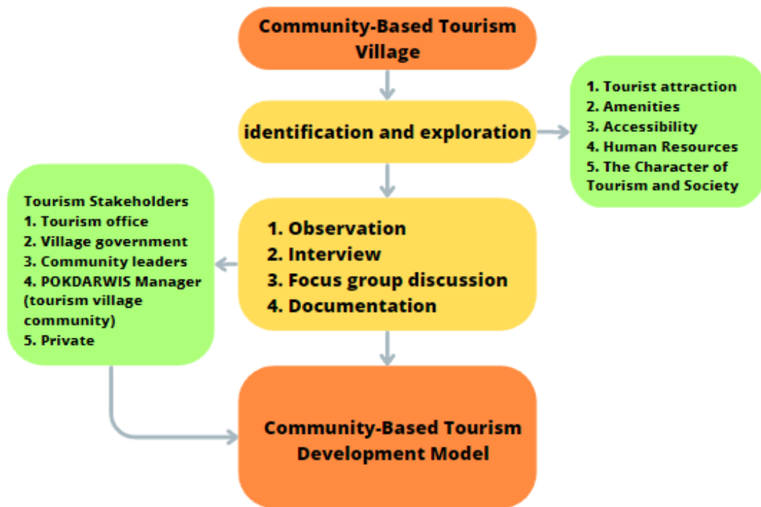
Figure 1. Research Flow

Research data were analyzed using qualitative analysis techniques. Researchers also interpret the data that has been classified. Checking the validity of the data was carried out by triangulation with various sources, both primary and secondary, until the data obtained was saturated. The data analyzed in this research will produce a community-based tourism model and become a conclusion from observations and interviews in the field. After producing a community-based tourism village model, it will be compared with other theories and other research results so that it will produce an appropriate