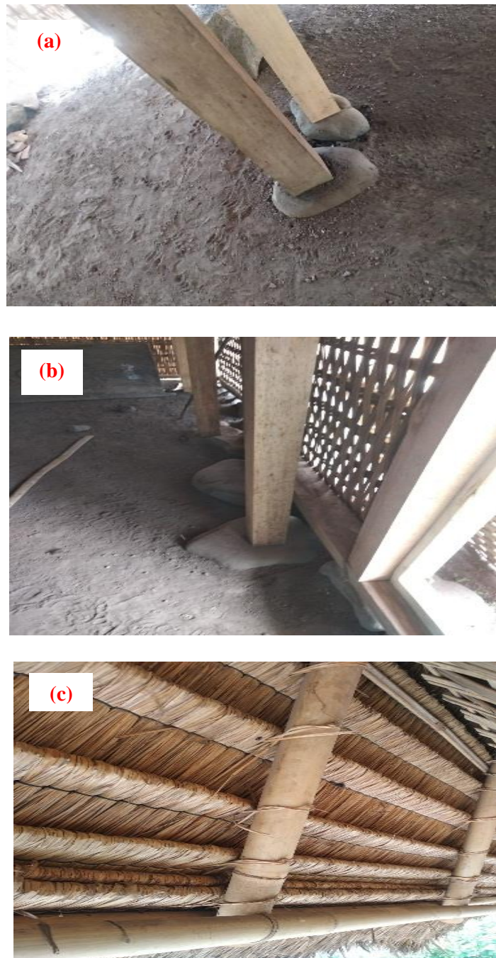
Figure 3. a) Floor, b) Pole, c) Roof Source: researcher documentation December 2020

2020). Besides vibration resistance, the people deliberately used natural materials on the floors to maintain the customary values believed by the community.