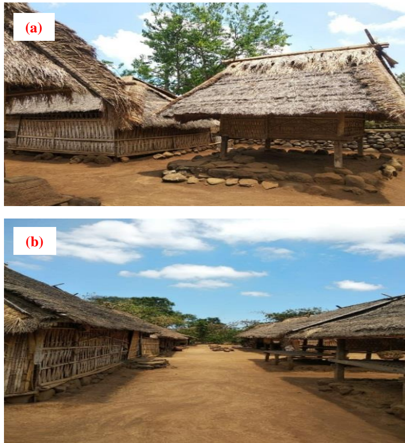
Figure 4. a. the form of the Dasan Beleq traditional house b. the position of the Dasan Beleq traditional house

Besides carrying out some traditional rituals before building a house, the people of Dasan Beleq Hamlet also adhered to a belief not to build houses with back-to-back positions. The position of the Dasan Beleq traditional house can be seen in the Figure 4b. This certainty was aimed for mutual respect between the fellow communities. In the dry season, people were prohibited from making a too big fire since it was a source of disaster and calamities, regarding all materials for building the house were